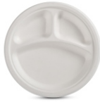
Product code: HCB-RP93CP 9"| Ivory White | Round 3CP