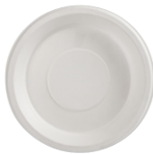
Product code: HCB-RP9D 9"| Ivory White | Round Deep