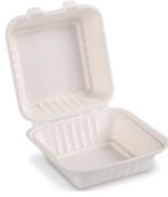
Product code: HCB-CL662 6" x 6" | Ivory White | Square