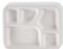
Product code: HCB-MT5CP2 Ivory White | Rectangle