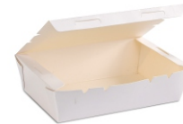
Product code: HCB-PFBW900 900 ML | White | Rectangle