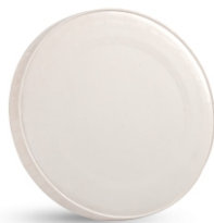
Product code: HCB-PLP90 360/480 ML | White | Round