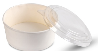
Product code: HCB-HCB-RCFWL750 750 ML | White | Round