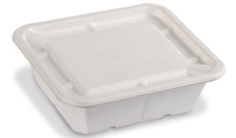
Product code: HCB-SCL750 750 ML | Ivory White | Square