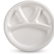
Product code: HCB-RP114CP 11"| Ivory White | Round 4CP