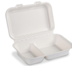
Product code: HCB-CL1062CP 10" x 6" | Ivory White | Rectangle