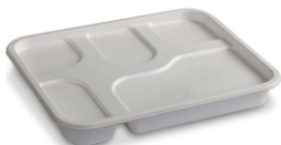
Product code: HCB-MT5CPL1 Ivory White | Rectangle