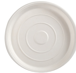
Product code: HCB-RP12D 12"| Ivory White | Round Deep