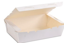
Product code: HCB-PFBW2100 2100 ML | White | Rectangle