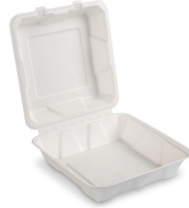
Product code: HCB-CL99 9" x 9" | Ivory White | Square