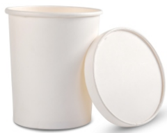
Product code: HCB-RCWL1500 1500 ML | White | Round Tall