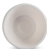
Product code: HCB-RBD240 240 ML | Ivory White | Round