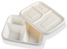
Product code: HCB-MT3CPL1 Ivory White | Rectangle