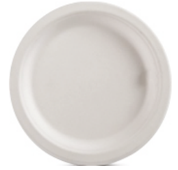
Product code: HCB-RP11 11"| Ivory White | Round Plain