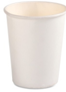
Product code: HCB-PCSWW360 360 ML | White | Round