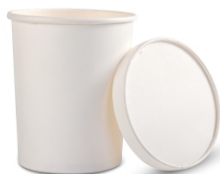
Product code: HCB-RCWL1250 1250 ML | White | Round Tall