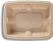
Product code: HCB-MB650 650 ML | Natural | Rectangle