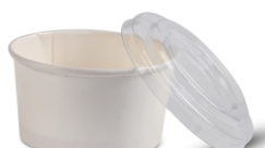
Product code: HCB-RCWL100 100 ML | White | Round