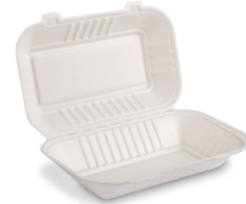
Product code: HCB-CL96 9" x 6" | Ivory White | Rectangle