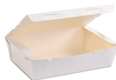
Product code: HCB-PFBW1600 1600 ML | White | Rectangle