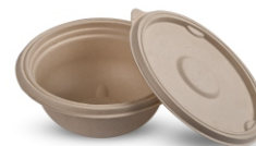
Product code: HCB-RB1000 1000 ML | Natural | Round