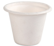
Product code: HCB-RT120 120 ML | Ivory | Round