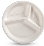
Product code: HCB-RP103CP 10"| Ivory White | Round 3CP