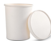
Product code: HCB-RCWL750 750 ML | White | Round Tall