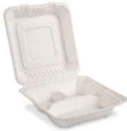
Product code: HCB-CL883CP 8" x 8" | Ivory White | Square