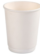
Product code: HCB-PCDWW480 480 ML | White | Round