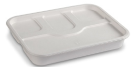
Product code: HCB-MT4CPL Ivory White | Rectangle