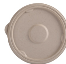
Product code: HCB-RBL1000 1000 ML | Natural | Round