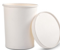
Product code: HCB-RCWL1000 1000 ML | White | Round Tall