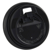
Product code: HCB-SLB90 90 MM | Black | Round