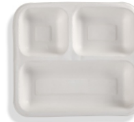
Product code: HCB-MT3CP3 Ivory White | Rectangle