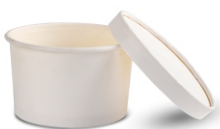
Product code: HCB-RCWL350 350 ML | White | Round Tall