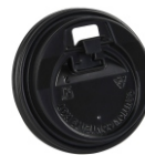
Product code: HCB-SLB80 80 MM | Black | Round