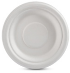
Product code: HCB-RP6DE 6"| Ivory White | Round Design