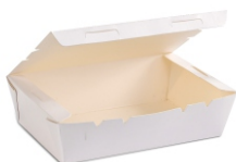
Product code: HCB-PFBW1250 1200 ML | White | Rectangle