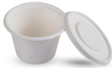
Product code: HCB-RTCL500 500 ML | Ivory White | Round Tall