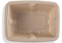
Product code: HCB-MB1000 1000 ML | Natural | Rectangle