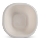
Product code: HCB-KB120 120 ML | Ivory White | Kiwi Bowl