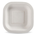
Product code: HCB-SP5 5"| Ivory White | Square