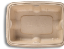
Product code: HCB-MB750 750 ML | Natural | Rectangle