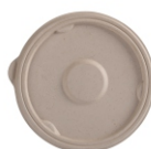
Product code: HCB-RBL500 500 ML | Natural | Round