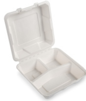
Product code: HCB-HCB-CL993CP 9" x 9" | Ivory White | Square