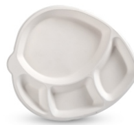
Product code: HCB-LP144CP 14"| Ivory White | Leaf