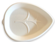
Product code: HCB-LP11 11"| Ivory White | Leaf